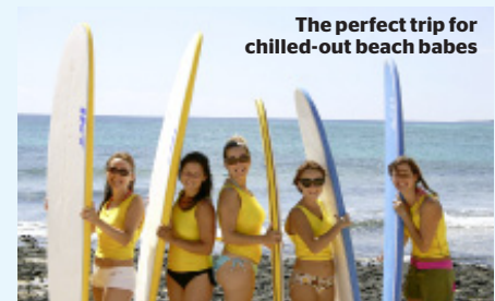
The perfect trip for chilled-out beach babes

Head to the island of Fuerteventura in the Canaries to combine holistic chills with surfing thrills on a Pilates, Yoga & Surf Holiday. As well as daily yoga and Pilates, you'll enjoy three days of surf lessons (four hours a day), morning meditation, beach walks and sand dune stretch sessions, and a 60-minute massage is also thrown in. From £574 for seven nights' bed and breakfast in a peaceful bungalow. Flights not included. The holidays run from 10, 21 and 28 September. Visit www.golearnto.com