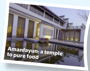
Amanfayun: a temple to pure food

For a taste of Buddhism with a dash of luxury, tuck into authentic temple food at the Amanfayun resort in China.