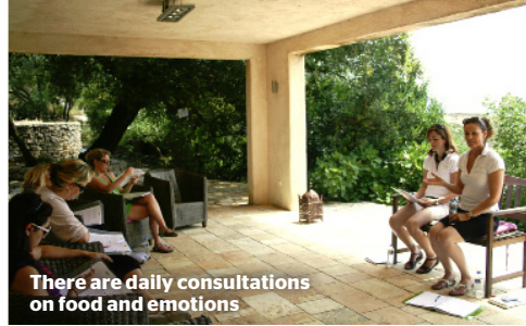
There are daily consultations on food and emotions

including one for avocado and chocolate mousse that promises to take me out of my culinary comfort zone. That's no bad thing, though - the sessions have re-educated me about nutrition, and I now appreciate what the Ancient Greek physician Hippocrates meant by 'Let food be thy medicine and medicine be thy food'. Here's hoping I don't fall off the wagon come cake o'clock.